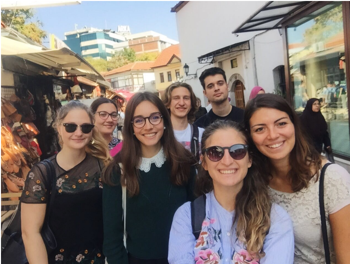
Meeting of Germany, Italy, Romania and France.