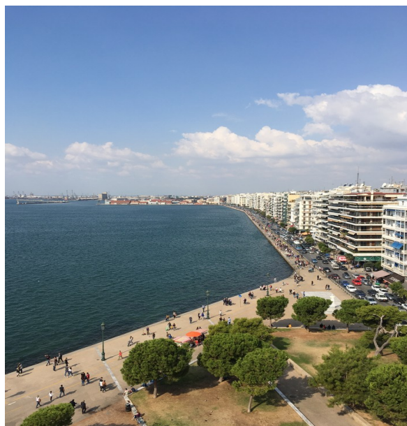
Atop of the White Tower