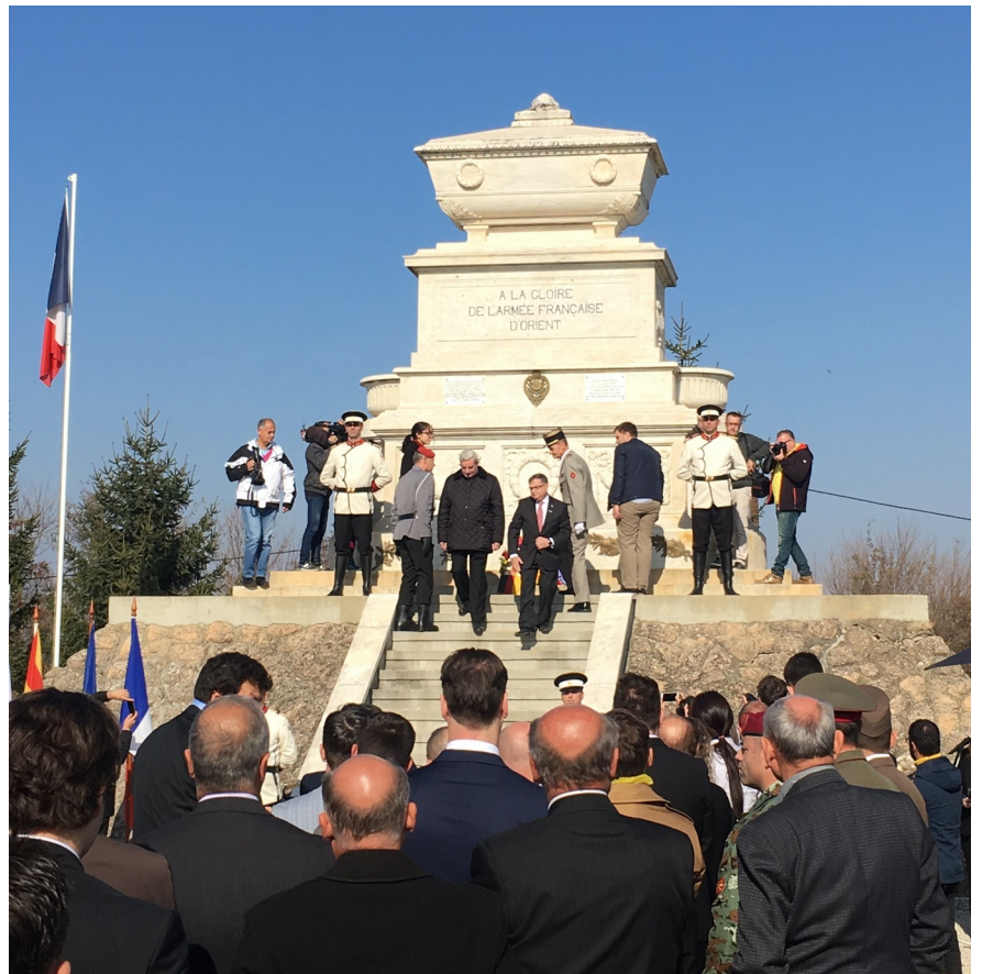
Centenary of the First World War in Bitola. Meeting with the Ambassador of France and the Ambassador of Germany.