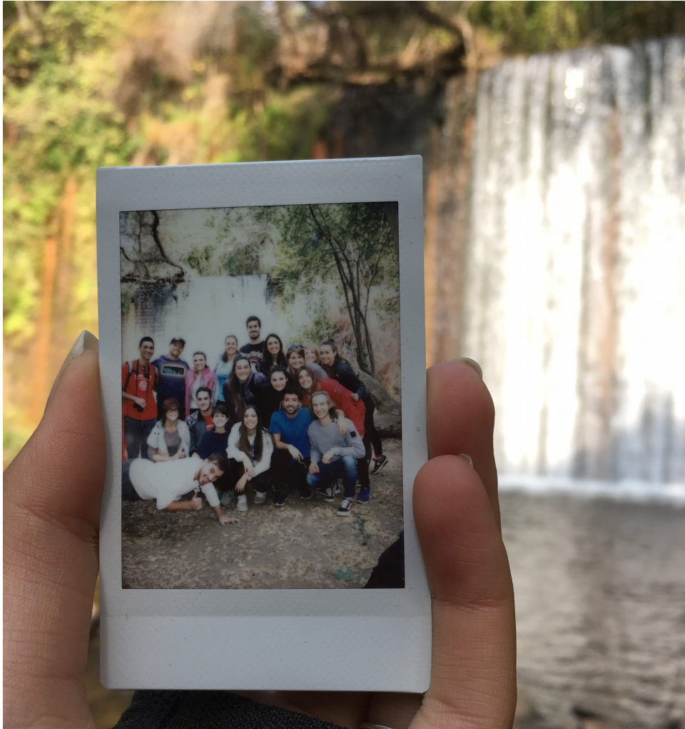
Meeting of Turkey, Poland, Croatia, Macedonia, France, Germany, and Spain.