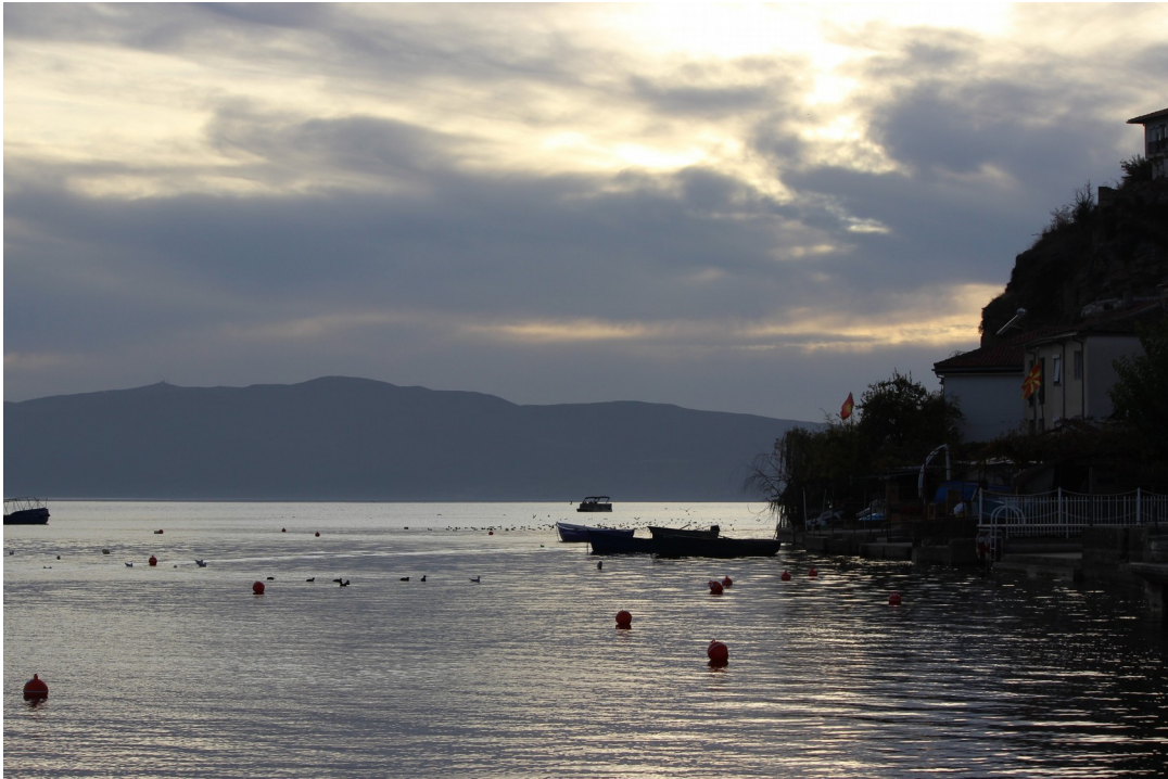
Ohrid Lake.